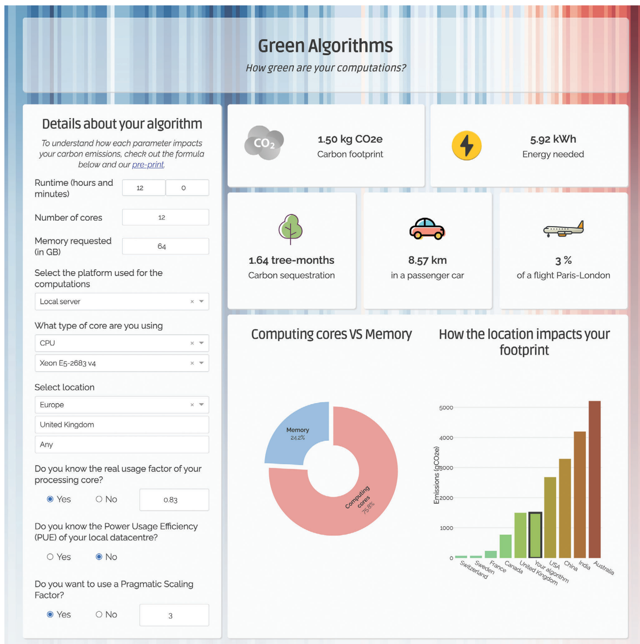
Figure 1. The Green Algorithms calculator (www.green-algorithms.org).

experiment runs for three weeks to simulate 5000 particles (protons) using 24 processing threads and up to 10 GB of memory. Using the Green Algorithms tool, and assuming an average CPU power draw (such as the Xeon E5-2680, capable of running 24 threads on 12 cores), and worldwide average values for PUE and CI, we estimated that a single experiment emits 49 465 gCO 2 e. When taking into account a PSF of 11, corresponding to the 11 different energy levels tested, the carbon footprint of such study is 544 115 gCO 2 e. Using estimates of car and air travel (Experimental Section), 544 115 gCO 2 e is approximately equivalent to driving 3109 km (in a European car) or flying economy from New